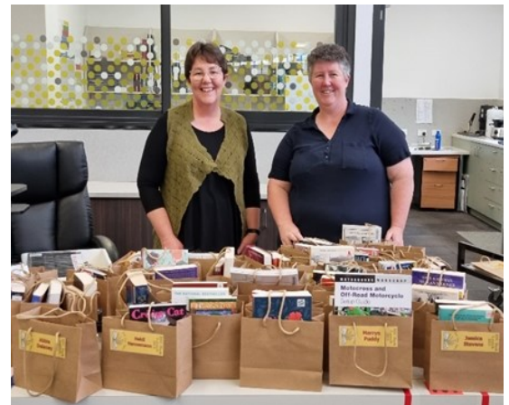
Librarians were very happy to see the bags full of books.

VM students prepared a delicious lunch/afternoon tea for students attending the book launch, which they devoured with gusto.