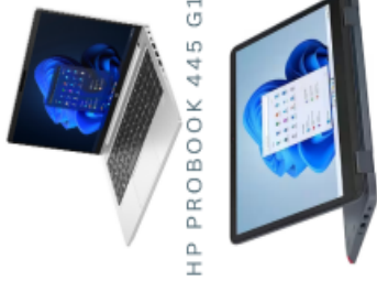
HP PROBOOK 445 G10