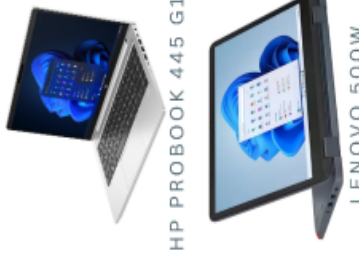
HP PROBOOK 445 G10