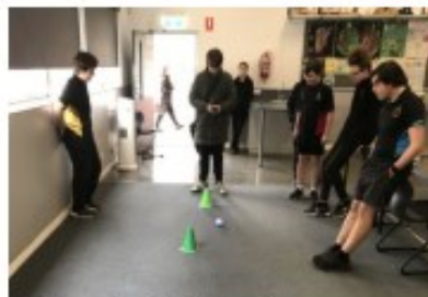
Sphero robot challenge using app.