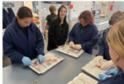
Dissecting a cow eye (or observing it!)