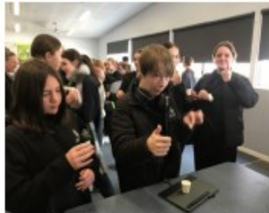
A crowd tried freeze dried ice-cream!

We've been celebrating National Science Week this week! We had daily quiz questions related to the theme of "Species Survival – More Than Just Sustainability" and lunchtime activities including origami Science models, Sphero robot challenge, cow eye dissection and tasting astronaut ice-cream.