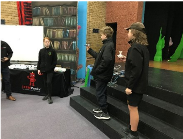
Lego build challenge with no instructions.

On August 20, 18 Year 8 students enjoyed taking part in an all-day STEM program in the school hall. The facilitators from STEM Punks were accompanied by an engineer associated with the Inland Rail Project. There was a focus on the new bridges that will need to be built here in Broadford to accommodate the increased height and load of the freight trains passing along the line from Melbourne to Brisbane. The facilitators were impressed with the ideas and determination of our students, in both the actual and virtual building challenges. The students also learned about various related careers that they could pursue. Please see some photos below: