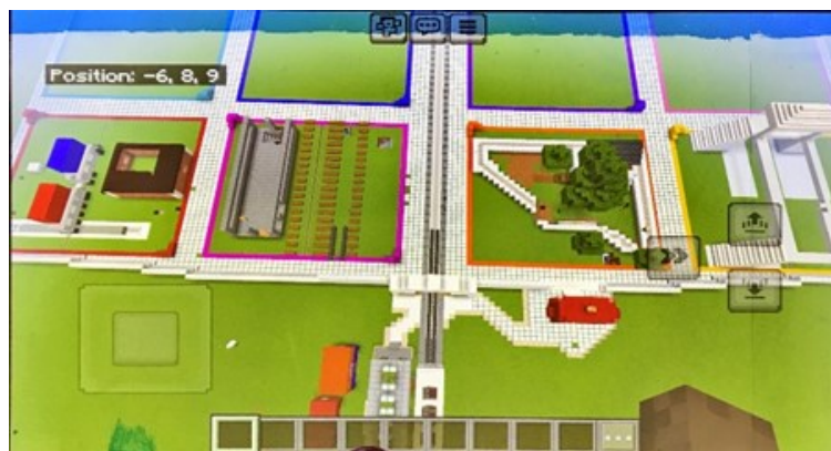
Building a train station environment using Minecraft Education.