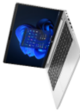
HP PROBOOK 445 G10

In 2024, we strongly encourage students to own a 1:1 device that will accompany other essential learning materials each lesson. As a school, we are no longer recommending i-Pads for student use at BSC. Below you will find two school recommended devices that can be purchased through the JB-HIFI Parent Portal which is linked to our school.